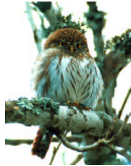
Photo of Ferruginous Pygmy-Owl