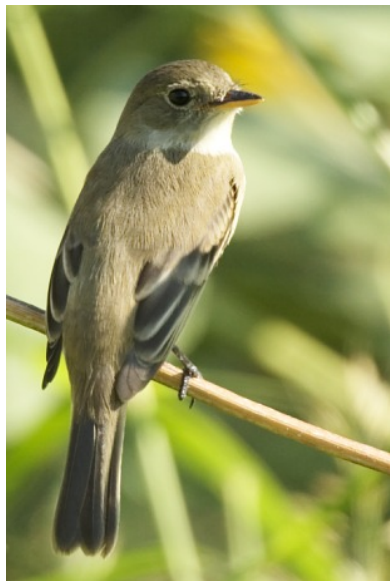
Willow Flycatcher