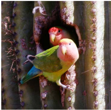
Peach-faced Lovebird