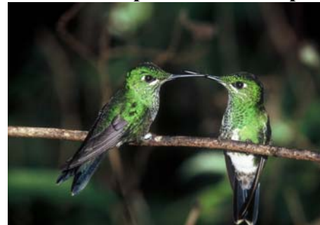
Two female Green-crowned Brilliants, Monteverde, Costa Rica.