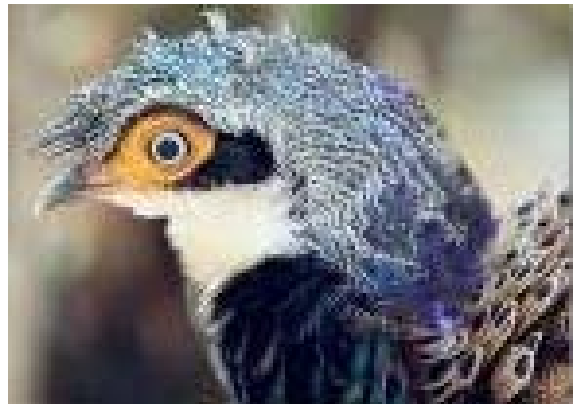
What bird is this?

January's Answer: Purple-headed Glossy Starling.