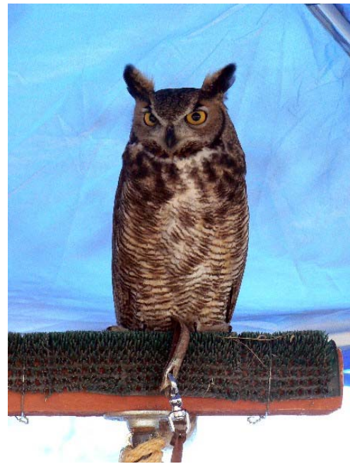
Great Horned Owl

Members of the Sonoran Audubon Society are conducting FREE monthly family-oriented bird walks at Tres Rios Wetlands in Phoenix on the 2nd Saturday morning of each month. The next walk is scheduled for Saturday, March 8, 2008 at 8:00 a.m. Join other outdoor enthusiasts on an easy hike through the desert, around the ponds and into the woods at this beautiful site. The walks will start at 8 and continue with the last one at 11 a.m.