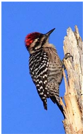
Ladder-backed Woodpecker

Although she worked full time for various firms in Manhattan, she took trips with professional birders and acquired a life list of 595 species. She took early retirement after 25 years with ConEd and moved to Arizona 10 years ago. Here she's been active in the Birders Anonymous group as well as a friend of Sonoran Audubon Society. She's a member of National Audubon Society and is especially interested in animal rights with membership in PETA, Animal Rights Society of the United States, Arizona Humane Society and the Humane Farming Association. As a member of the Sonoran Audubon Society, she's a member of an IBA team for the Arlington Wildlife Area.