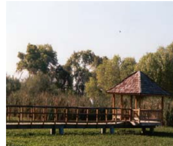
Tres Rios Haystack Site

Alice Brawley - Chesworth, City of Phoenix, "Future Plans for Tres Rios"