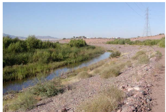
Rio Salado Riparian Preserve

Everyone involved seemed pleased with the results. The actual monitoring of the Rio Salado Riparian Habitat will begin in earnest starting in January, 2007, by the volunteers.