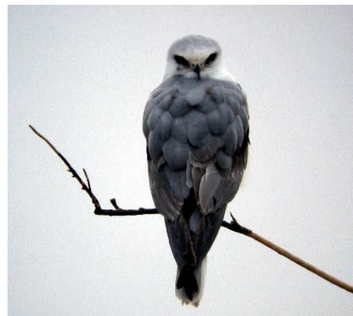
White-tailed Kite