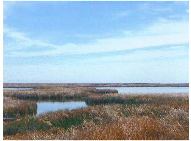
Cienega de Santa Clara