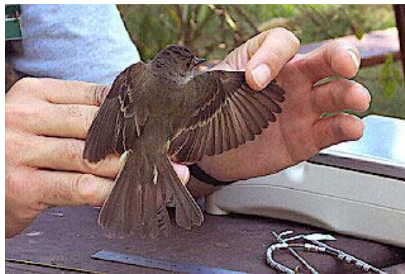
Southwestern Willow Flycatcher